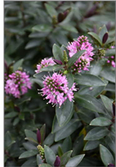
Pretty In Pink Hebe flowers