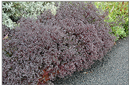
Bertram Anderson Stonecrop