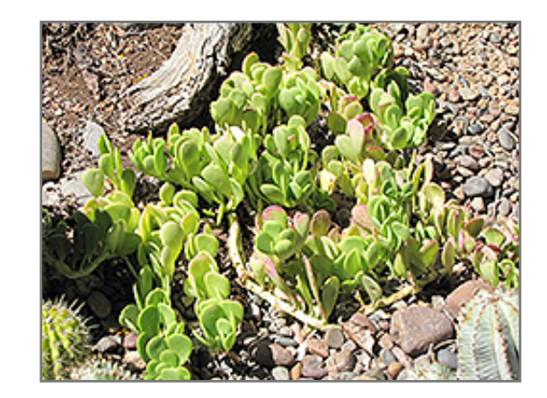
Trailing Jade