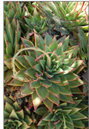
Molded Wax Echeveria foliage