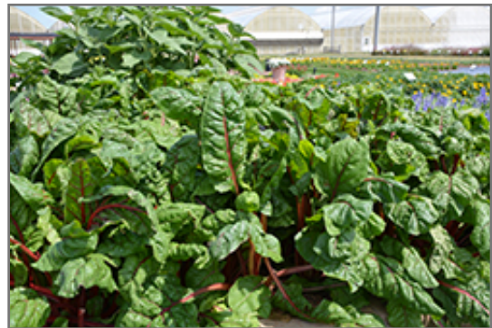
Ruby Red Swiss Chard