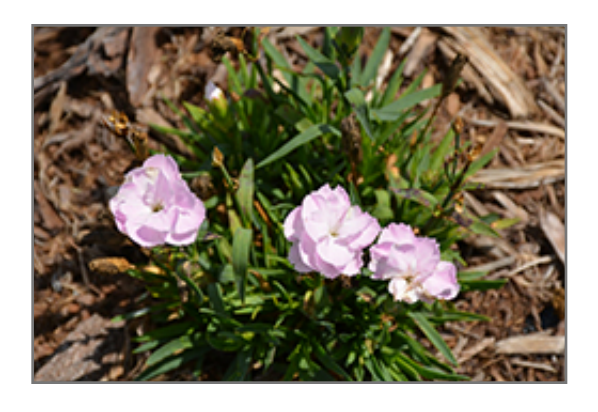
Constant Beauty Pink Pinks flowers