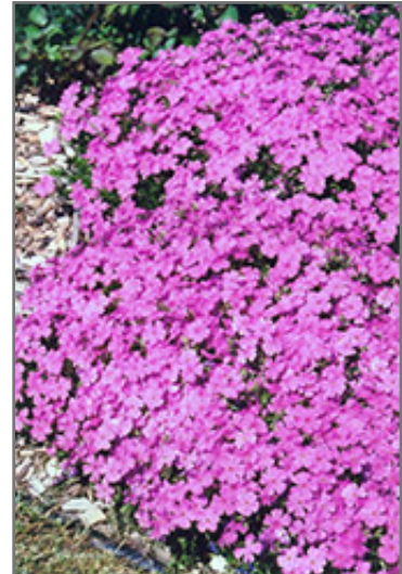
Arctic Phlox flowers