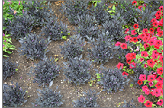
Onyx Red Ornamental Pepper