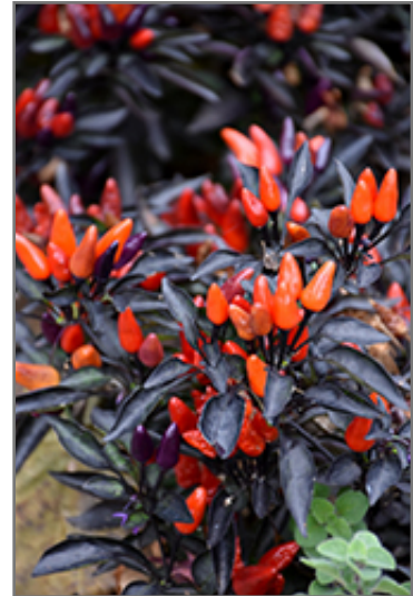
Explosive Ember Ornamental Pepper fruit

Explosive Ember Ornamental Pepper will grow to be about 18 inches tall at maturity, with a spread of 14 inches. When planted in rows, individual plants should be spaced approximately 14 inches apart. This vegetable plant is an annual, which means that it will grow for one season in your garden and then die after producing a crop.