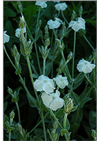
White Rose Campion flowers