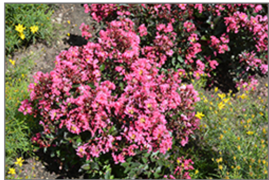
Barista Brew Ha Ha Crapemyrtle in bloom