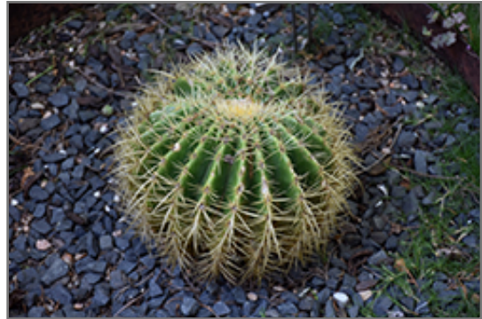
Golden Barrel Cactus

Golden Barrel Cactus is a succulent evergreen plant. It is a member of the cactus family, which are grown primarily for their characteristic shapes, their interesting features and textures, and their high tolerance for hot, dry growing environments. Like all cacti, it doesn't actually have leaves, but rather modified succulent stems that comprise the bulk of the plant, and which are designed to hold water for long periods of time. This particular cactus is valued for its distinctive barrel shape, and usually grows as a single spiny ribbed green stem. This plant has yellow cup-shaped flowers held atop the stems from late spring to early summer, which are interesting on close inspection.