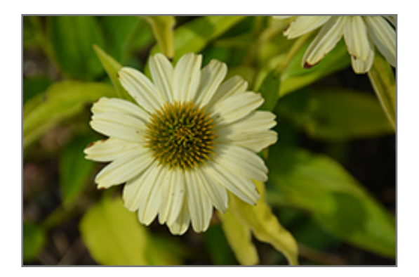
Eye-Catcher Canary Feathers Coneflower flowers