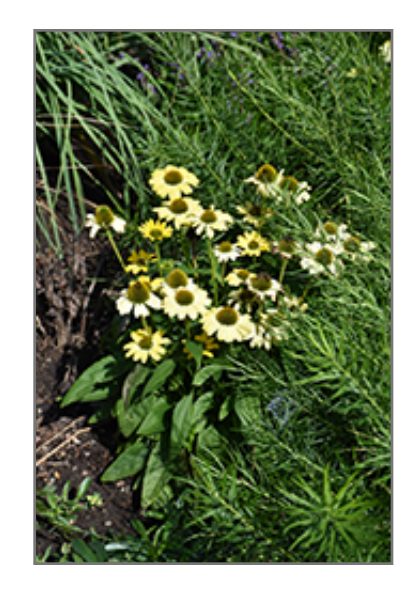
Eye-Catcher Canary Feathers Coneflower in bloom