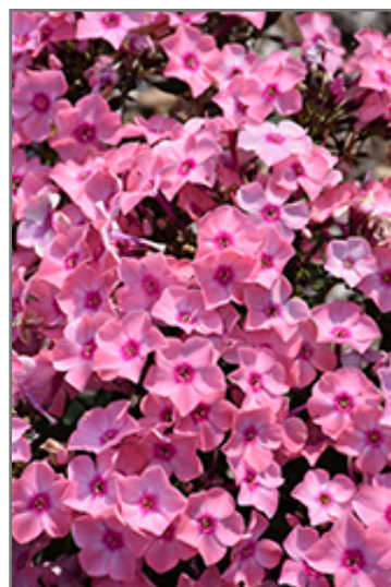
Sweet Summer Queen Garden Phlox flowers

Sweet Summer Queen Garden Phlox is recommended for the following landscape applications;