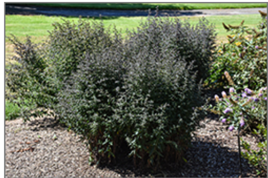
Prince Calico Aster