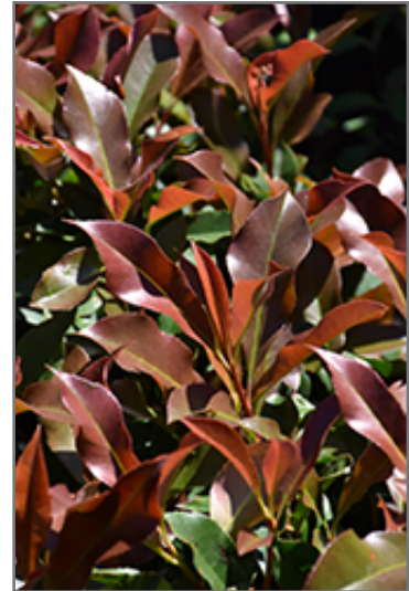
Red Fury Photinia foliage