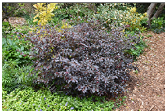
Garnet Fire Fringeflower