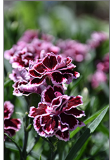
Odessa Pierrot Pinks flowers