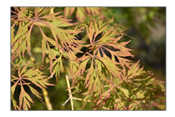
Ice Dragon Maple foliage