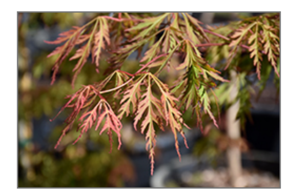
Ice Dragon Maple foliage

303 Owen Manor Saskatoon, SK, S7V 0P1 phone: 306-955-9580 www.wilsonslifestyle.ca