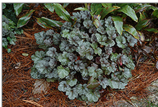
Swirling Fantasy Coral Bells