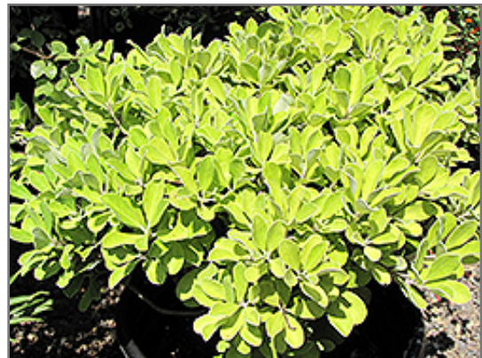
Nana Pittosporum