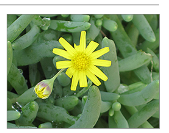
Little Pickles flowers

An interesting and beautiful succulent variety producing short, swollen, blue-green pickle shaped foliage that reaches upward; pretty yellow flowers from spring to fall; a perfect color accent in rock gardens, containers, or massed as groundcover