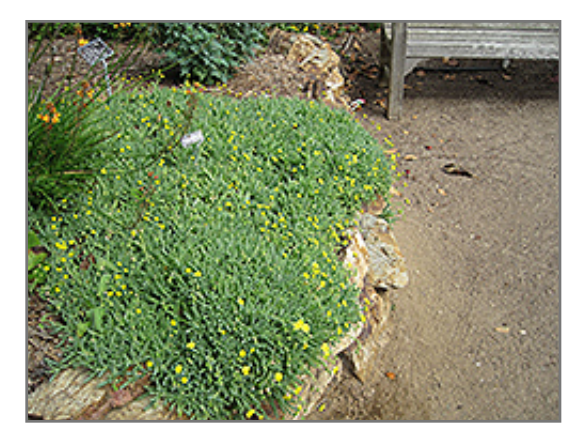
Little Pickles in bloom

Little Pickles will grow to be only 4 inches tall at maturity extending to 6 inches tall with the flowers, with a spread of 12 inches. Although it's not a true annual, this plant can be expected to behave as an annual in our climate if left outdoors over the winter, usually needing replacement the following year. As such, gardeners should take into consideration that it will perform differently than it would in its native habitat.