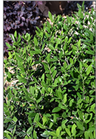
Little Ollie&reg Dwarf Olive foliage

Little Ollie&reg Dwarf Olive makes a fine choice for the outdoor landscape, but it is also well-suited for use in outdoor pots and containers. With its upright habit of growth, it is best suited for use as a 'thriller' in the 'spiller-thriller-filler' container combination; plant it near the center of the pot, surrounded by smaller plants and those that spill over the edges. It is even sizeable enough that it can be grown alone in a suitable container. Note that when grown in a container, it may not perform exactly as indicated on the tag - this is to be expected. Also note that when growing plants in outdoor containers and baskets, they may require more frequent waterings than they would in the yard or garden. Be aware that in our climate, most plants cannot be expected to survive the winter if left in containers outdoors, and this plant is no exception. Contact our experts for more information on how to protect it over the winter months.