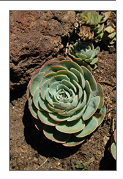
Blue Rose Echeveria