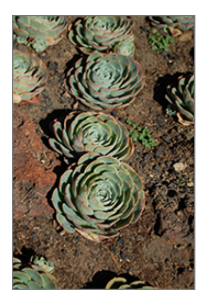
Blue Rose Echeveria