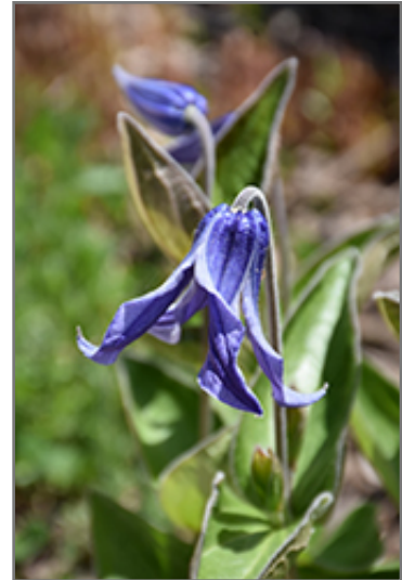
Blue Ribbons Bush Clematis flowers