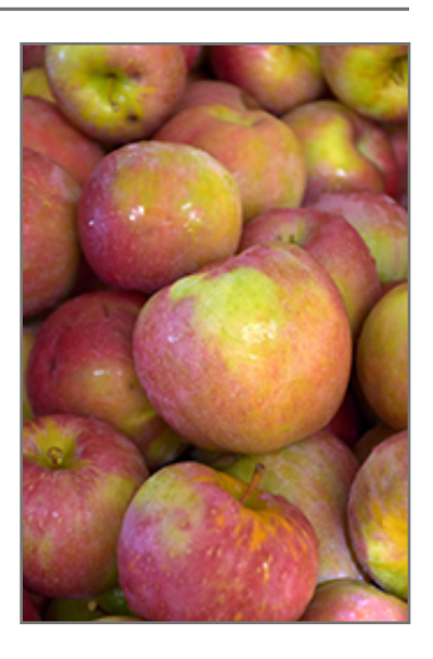
Evercrisp Apple fruit

Aside from its primary use as an edible, Evercrisp Apple is sutiable for the following landscape applications;