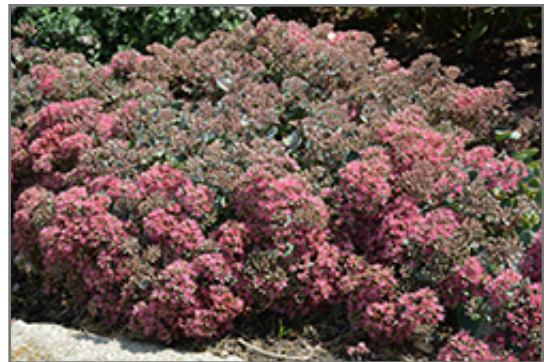
Popstar Stonecrop in bloom