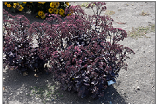
Cherry Truffle Stonecrop in bloom