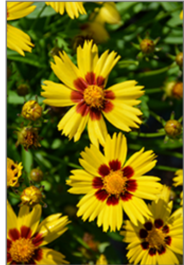
Sunkiss Tickseed flowers