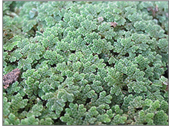
Mosquito Fern foliage

Mosquito Fern will grow to be only 1 inch tall at maturity, with a spread of 3 feet. Its foliage tends to remain low and dense right to the ground. It grows at a fast rate, and under ideal conditions can be expected to live for approximately 5 years. As an herbaceous perennial, this plant will usually die back to the crown each winter, and will regrow from the base each spring. Be careful not to disturb the crown in late winter when it may not be readily seen!