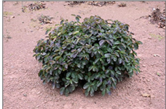
C.A. Hildebrant's Viburnum in fall

C.A. Hildebrant's Viburnum is recommended for the following landscape applications;