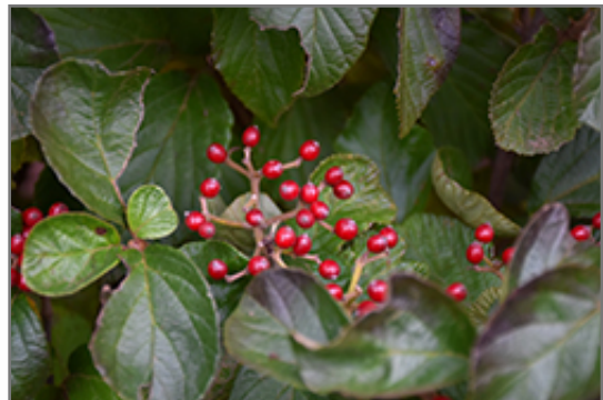
C.A. Hildebrant's Viburnum fruit