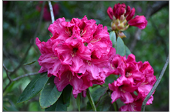
Aronimink Rhododendron flowers

Aronimink Rhododendron will grow to be about 5 feet tall at maturity, with a spread of 5 feet. It tends to be a little leggy, with a typical clearance of 1 foot from the ground, and is suitable for planting under power lines. It grows at a slow rate, and under ideal conditions can be expected to live for 40 years or more.