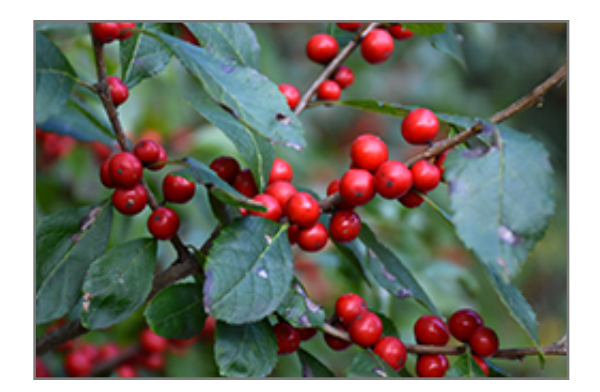
Stoplight Winterberry fruit