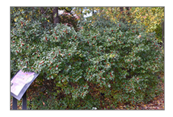
Stoplight Winterberry fruit