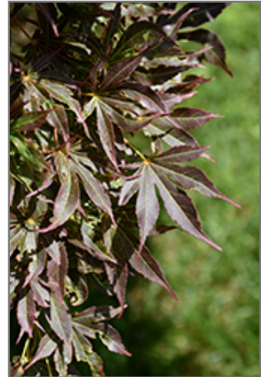
Tsukushi Gata Japanese Maple foliage