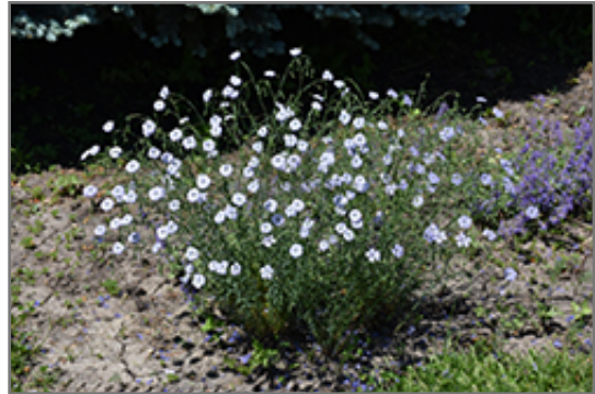
Blue Sapphire Perennial Flax in bloom