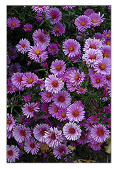
Purple Dome Aster flowers