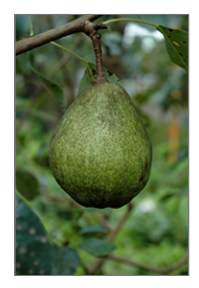
Kieffer Pear fruit