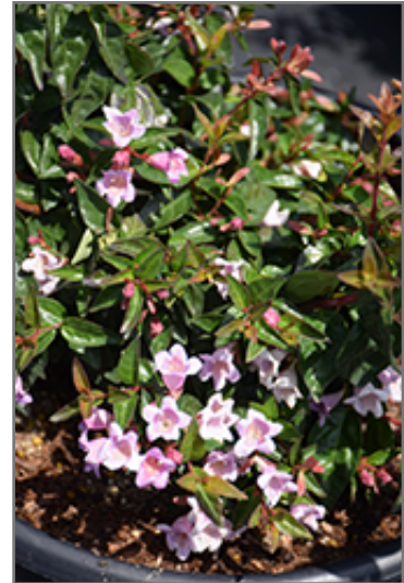
Sunrise Abelia flowers

Sunrise Abelia makes a fine choice for the outdoor landscape, but it is also well-suited for use in outdoor pots and containers. Because of its height, it is often used as a 'thriller' in the 'spiller-thriller-filler' container combination; plant it near the center of the pot, surrounded by smaller plants and those that spill over the edges. It is even sizeable enough that it can be grown alone in a suitable container. Note that when grown in a container, it may not perform exactly as indicated on the tag - this is to be expected. Also note that when growing plants in outdoor containers and baskets, they may require more frequent waterings than they would in the yard or garden. Be aware that in our climate, most plants cannot be expected to survive the winter if left in containers outdoors, and this plant is no exception. Contact our experts for more information on how to protect it over the winter months.