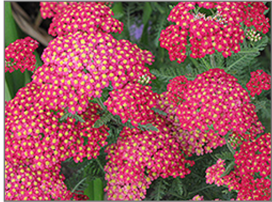
Galaxy Paprika Yarrow flowers

Galaxy Paprika Yarrow is recommended for the following landscape applications;