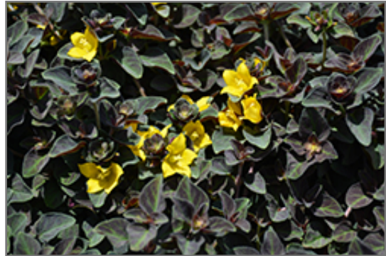
Midnight Sun Moneywort flowers