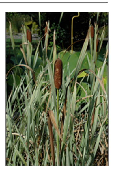
Variegated Cattail flowers