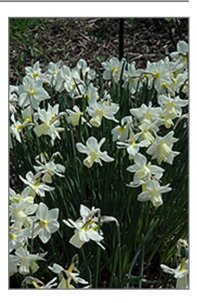
Curlew Daffodil flowers

A gorgeous addition to any garden, this variety produces flowers that are bright white with pale yellow cups that mature to ivory; very showy in the garden or containers