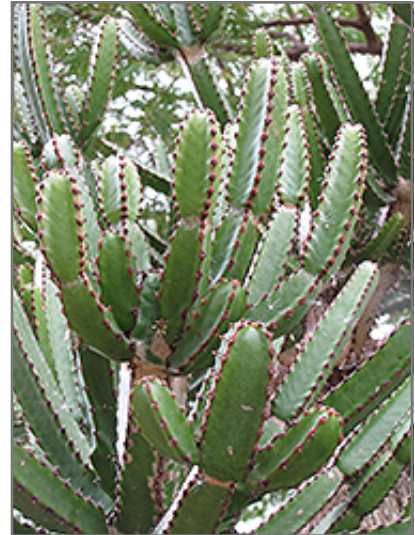
Naboom foliage