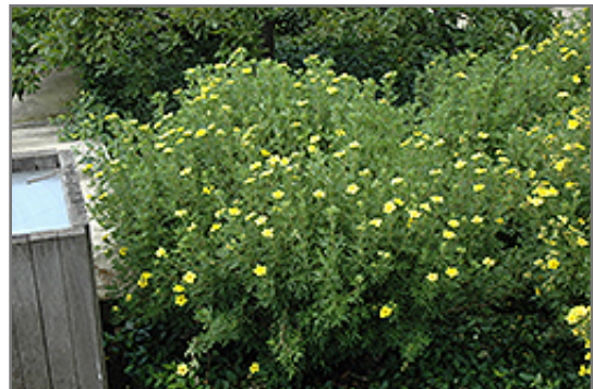
Fredheim Potentilla in bloom