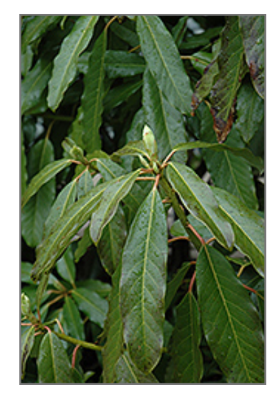
Daphniphyllum foliage