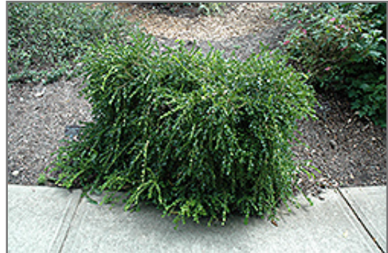
Unraveled Boxwood