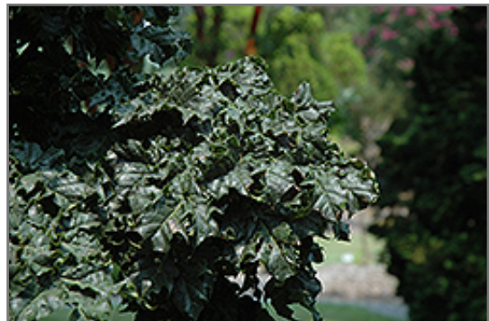
Stand Fast Norway Maple foliage