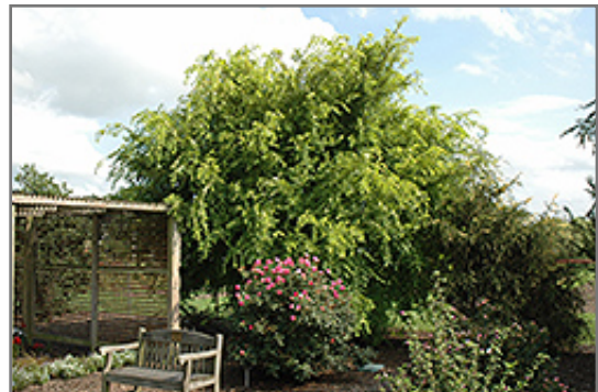
Golden Chinese Elm