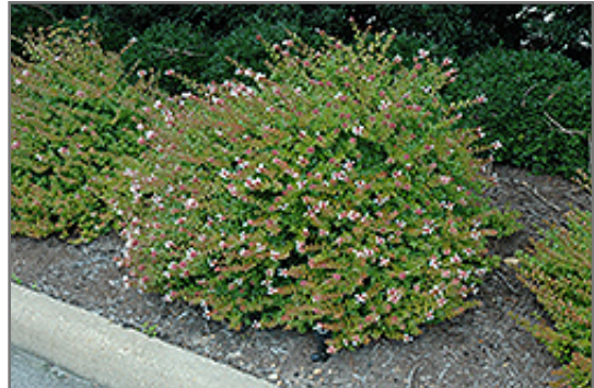
Rose Creek Abelia in bloom

Rose Creek Abelia is recommended for the following landscape applications;