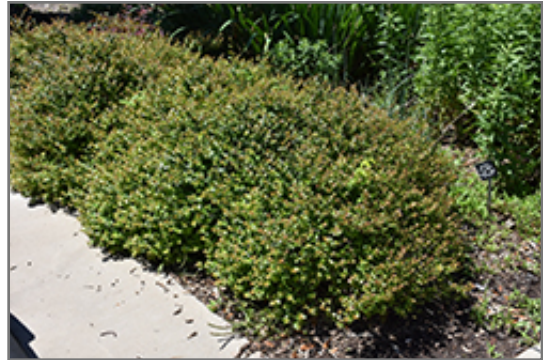
Rose Creek Abelia

Rose Creek Abelia makes a fine choice for the outdoor landscape, but it is also well-suited for use in outdoor pots and containers. Because of its height, it is often used as a 'thriller' in the 'spiller-thriller-filler' container combination; plant it near the center of the pot, surrounded by smaller plants and those that spill over the edges. It is even sizeable enough that it can be grown alone in a suitable container. Note that when grown in a container, it may not perform exactly as indicated on the tag - this is to be expected. Also note that when growing plants in outdoor containers and baskets, they may require more frequent waterings than they would in the yard or garden. Be aware that in our climate, most plants cannot be expected to survive the winter if left in containers outdoors, and this plant is no exception. Contact our experts for more information on how to protect it over the winter months.