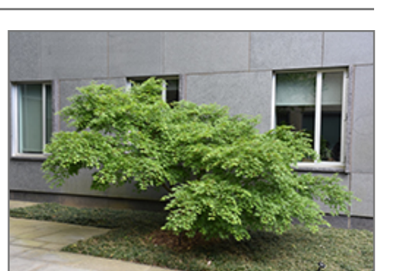
Ibo Nishiki Japanese Maple