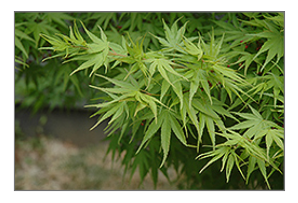
Ibo Nishiki Japanese Maple foliage

303 Owen Manor Saskatoon, SK, S7V 0P1 phone: 306-955-9580 www.wilsonslifestyle.ca